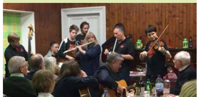
A Burns Supper in full swing at the newly upgraded Stobo Village Hall

Completion of these improvements has allowed the Hall to expand its activities and secure its future for the local community.