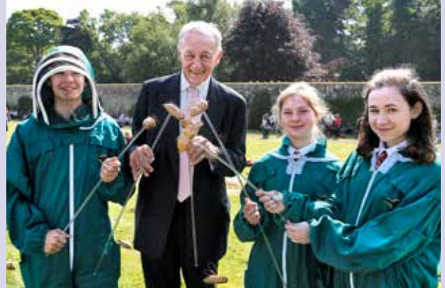
The Duke of Roxburghe admires bees from The Golden Swarm

The Golden Swarm celebrated beekeeping at Floors Castle, and its partnership with the High School Beekeeping Club, through community-based art activities and the production of a collective artwork.